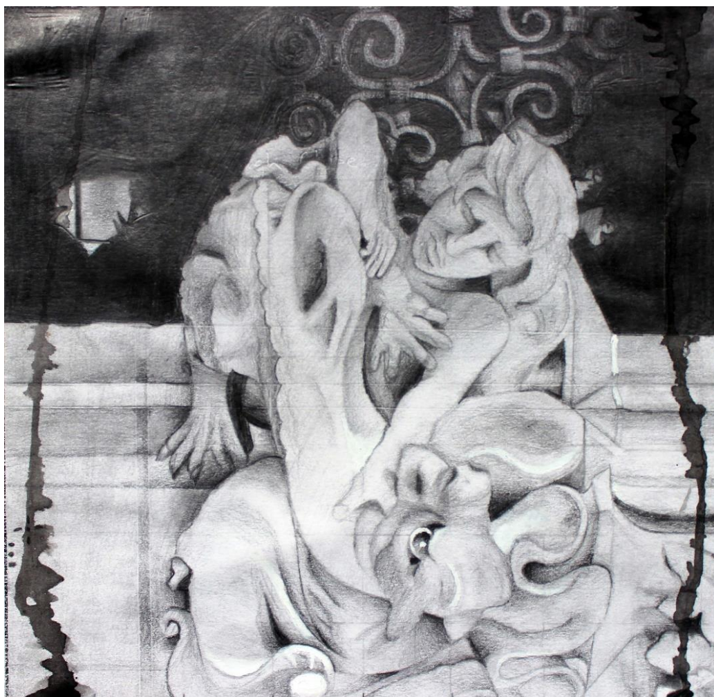
Bronagh Close 10D